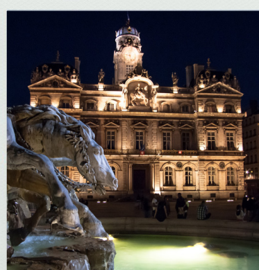
Hotel de ville